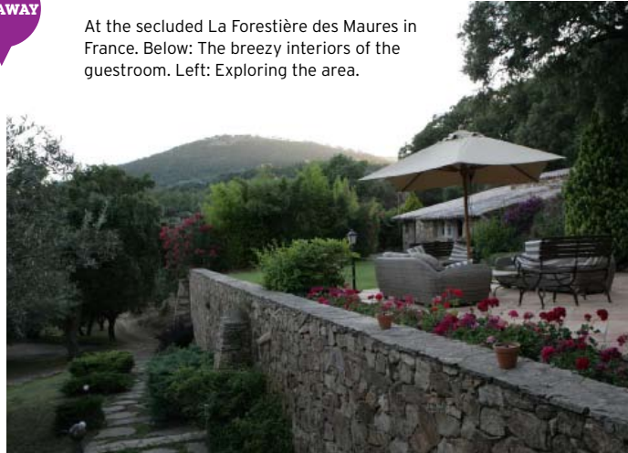
At the secluded La Forestière des Maures in France. Below: The breezy interiors of the guestroom. Left: Exploring the area.